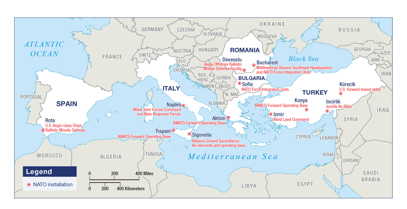
MAP 3 NATO's Presence in and Around the Mediterranean Basin