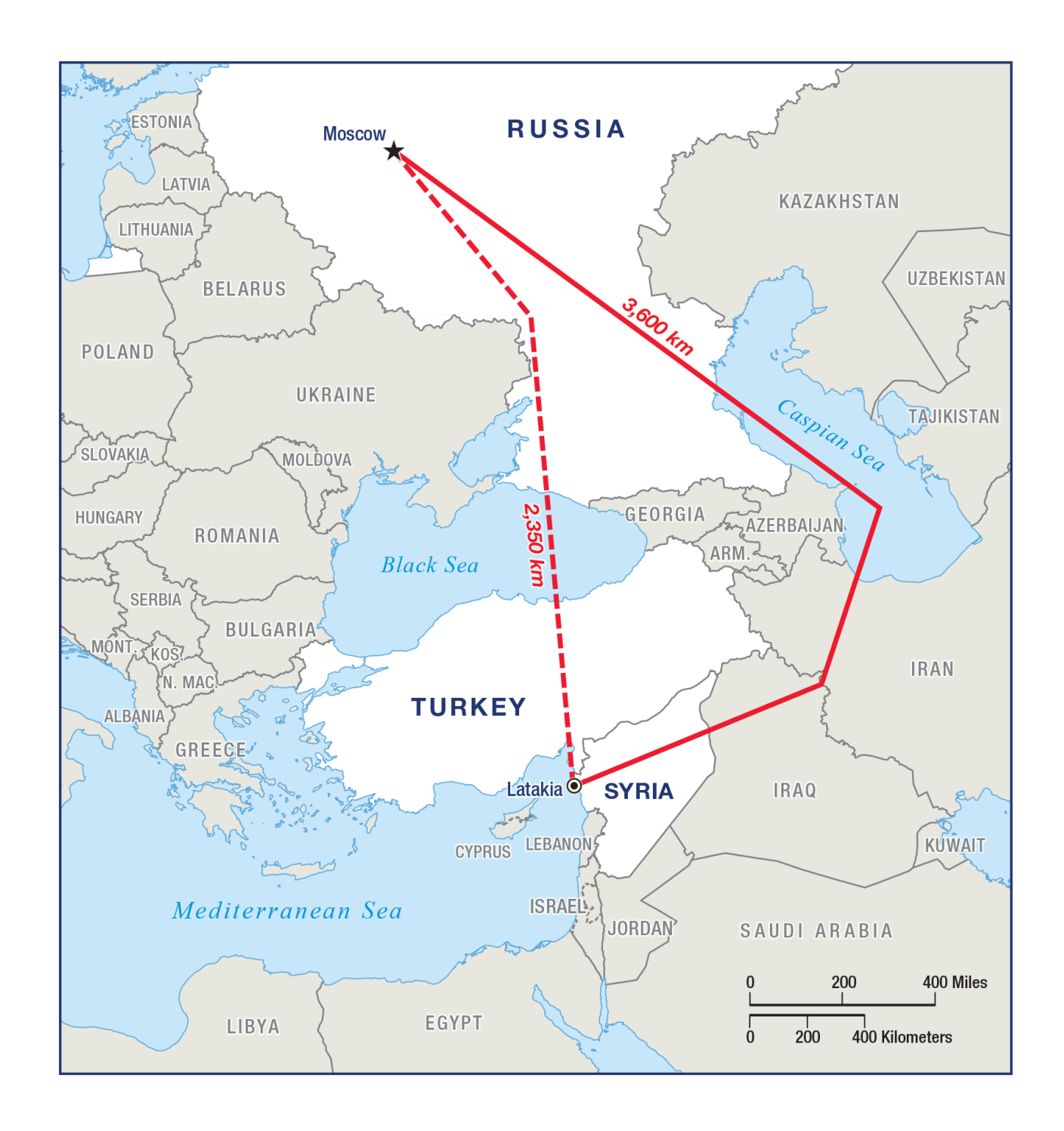
MAP 2 Moscow—Latakia Air Corridors